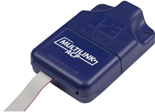
USB Multilink ACP Debug Probe